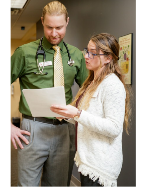
Staff practicing team-based care

For more information about diabetes, visit: https://www.cdc.gov/diabetes/basics/index.html