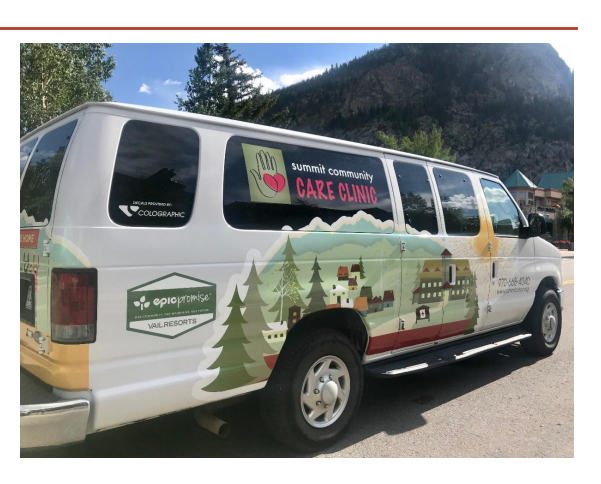
Vail EpicPromise donated a van to the Care Clinic which will give us the ability to provide mobile dental services later in 2020

The mobile dental service will focus on helping our under-served adult populations (low income, uninsured and Medicaid) as well as our growing senior populations. It will also expand access to the Colorado Senior Dental Program and Medicaid. No one will be turned away due to inability to pay! Our mobile dental services will start with initial outreach with a hygienist and one mobile unit, but will grow and expand to include a dentist and assistant for restorative services as well as hygiene. Look for the van in your neighborhood later in 2020!